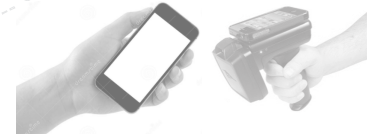
Transact & Search (passive)