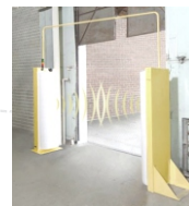
Service Facility Threshold (passive)